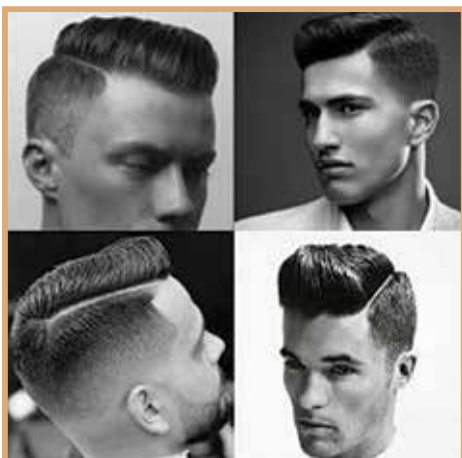
THE CLASSIC COMBER

Perfect your barbering techniques while developing your own style! Learn versatile style and cutting with a modern take on clipper cutting!