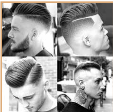
THE GENTLEMAN'S SMOOTH TAPER